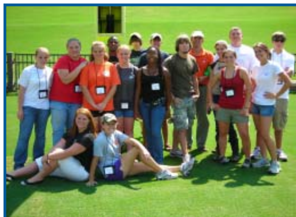
Students from 2007 SCCSA take a break from learning about athletic field management to pose for a picture.