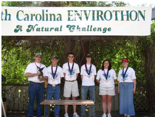
The first-place team in the state goes on to the Canon Envirothon's North American competition.

The South Carolina Envirothon is an annual hands-on environmental problem-solving competition for high school students. Participating teams compete for recognition and scholarships by demonstrating their knowledge of environmental science and natural resource management. The Envirothon competition tests the student's knowledge on topics such as soils, aquatics, forestry, wildlife and current environmental issues.