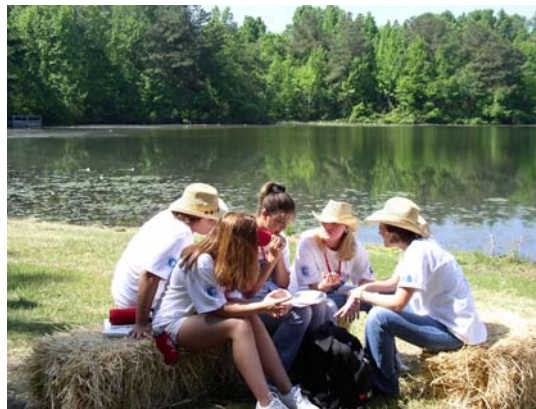
Teams have the opportunity to get "up close and personal" with South Carolina's natural resources.