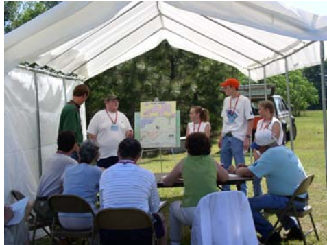
Teams participate in oral presentations before a panel of judges.

The South Carolina Envirothon is a statewide environmental science competition for high school students.