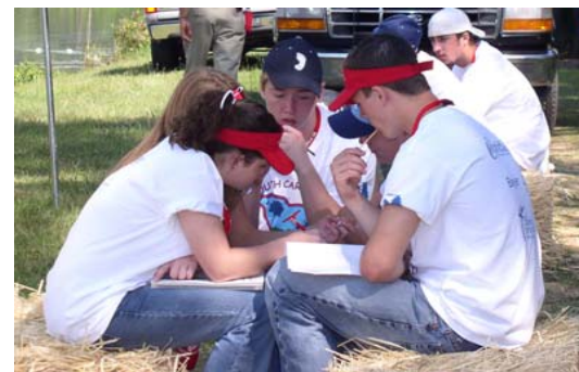
A team of students works together to complete the forestry test.

The winning team goes on to represent South Carolina at the Canon North American Envirothon, which is hosted by a different state or Canadian Province each year.